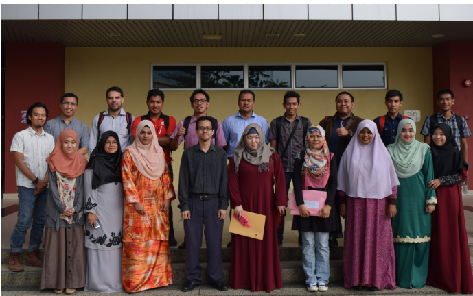
Participants of Workshop on how to write papers for IEEE TDEI

In this workshop, participants were briefed about IEEE TDEI aims and scope, criteria of acceptable papers and how to write a paper title, abstract, introduction section, methodology, results, discussion, conclusions and references. Participants were also trained on how to write a paper title and an abstract based on their research work through hands-on sessions.